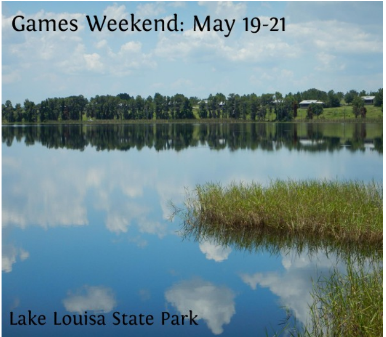
Lake Louisa State Park

Plus, a special TLC with Dinner, on May 26