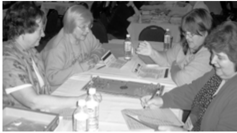
The notorious Spot-A-Shot gets a trial run