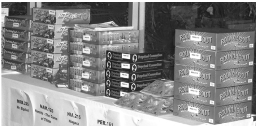
(SEE PAGE 34)

Mensa is an international society whose sole qualification for membership is a score at or above the 98th percentile on a standard IQ test. Mensa is a not-for-profit organization whose main purpose is to serve as a means of communication and assembly for its members. All opinions expressed herein are those of the individual authors, and not necessarily those of the editors or officers of Mensa. Mensa as an organization has no opinions. Visit American Mensa at http://www.us.mensa.org .